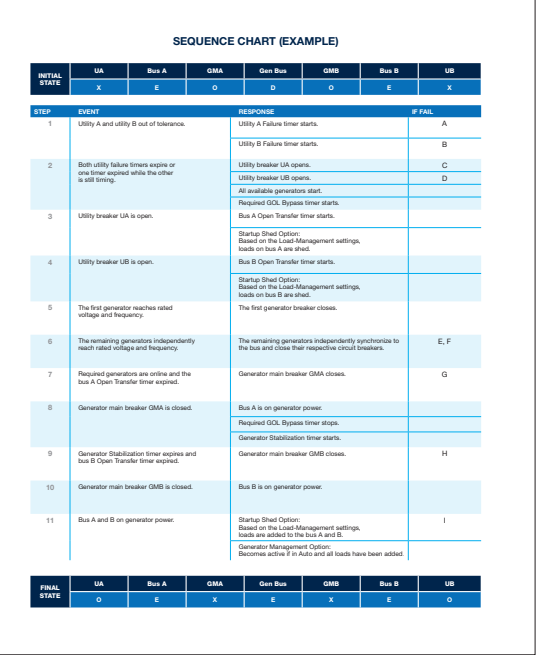
Kohler Chart-Based Sequence of Operation